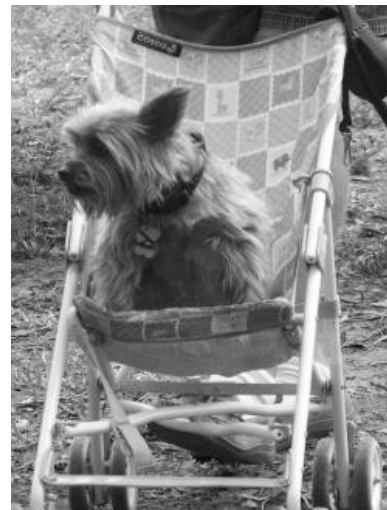
Chester's 2005 Sked