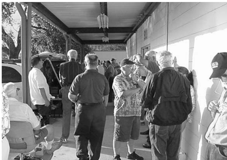
Crowd gathers at Chester's for a rainy day session in November, 2004