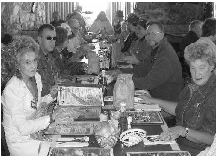
Club members, family and guests settle in for the After Holidays Party at the Four Coins Restaurant last January. The annual get-together has grown in numbers over the past few years.

NASA has a long relationship with amateur radio. There have been several amateur-radio-based shuttle experiments, amateur radio satellite launches. Astronauts on the shuttle and the International Space Station use amateur radio to communicate with students. Shuttle Columbia was the first ham radio station in space and three of the seven Columbia astronauts were licensed ham operators.