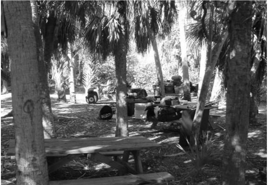
The working area for the Egmont Key Dxpedition last summer and the Egmont Key lighthouse, itself.