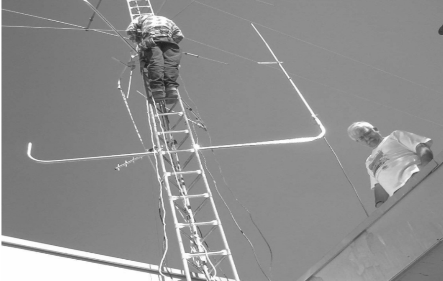
Freddie KF4FCW scales SPARC clubhouse tower to install new VHF-UHF antennas as Dee N4GD checks the installation.