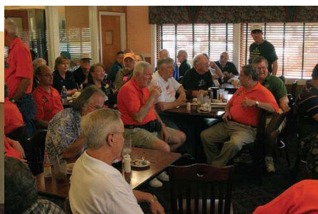
SPARC members at Florida Contest Group (FCG) meeting in Orlando