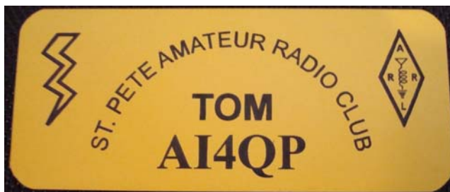
Badges available contact Tom