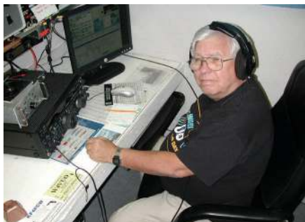
ARRL RTTY Roundup January 2009