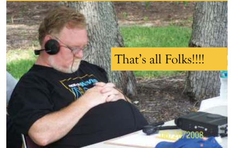
That's all Folks!!!!