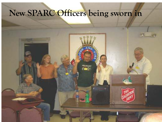
New SPARC Officers being sworn in