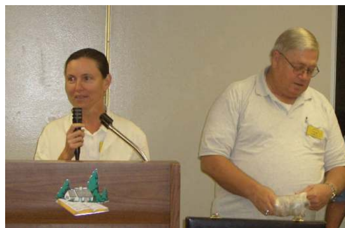
New And Past President. Thank you to both of you for serving!