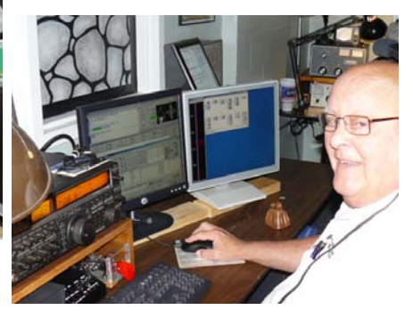
NAQP RTTY CONTEST