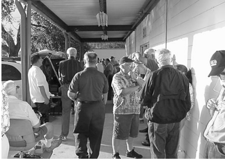
Crowd gathers at Chester's for a rainy day session in November, 2004