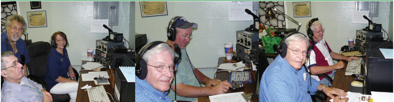
KG4PMC - WA4EEZ - WB2SUN