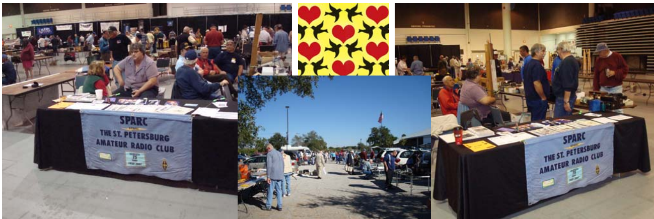
Below are pic from the ARRL RTTY ROUNDUP